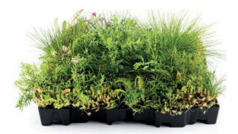
MOBIROOF ECO SEDUM & WILDFLOWER