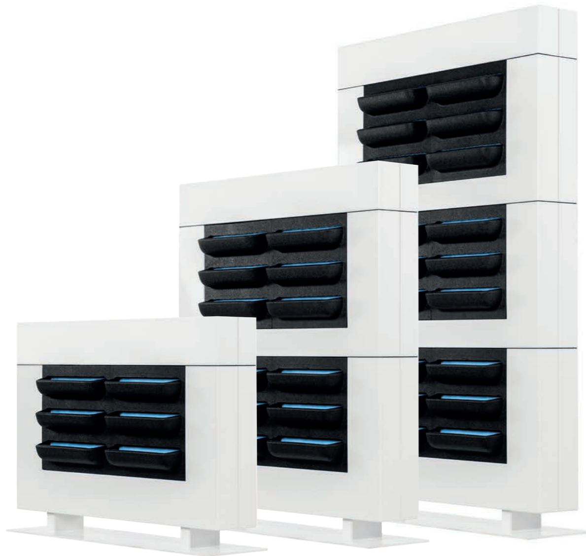
LIVEDIVIDER PLUS 1