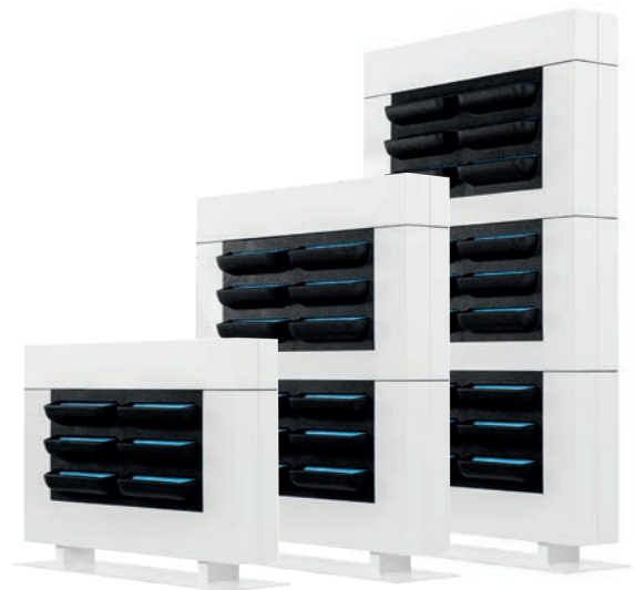
LiveDivider PLUS 1 LiveDivider PLUS 2 LiveDivider PLUS 3

The base plate and frame of the LiveDivider PLUS are made of powder-coated steel and are fully recyclable.